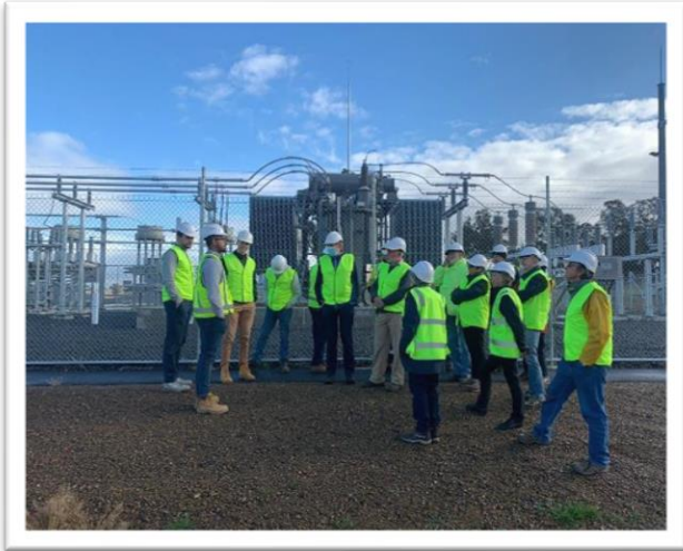
Members of the Wangaratta Sustainability Group tour the solar farm.