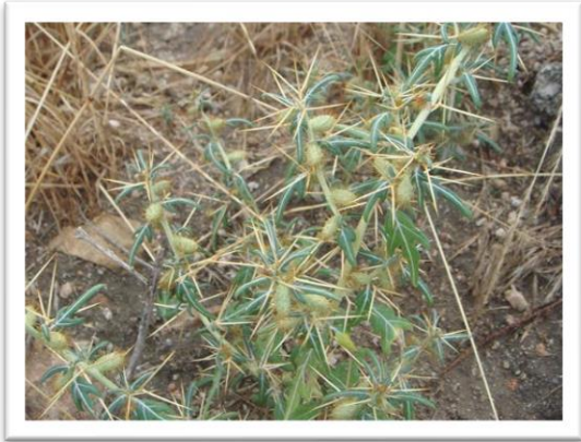
Bathurst Burr is progressively being removed from site.