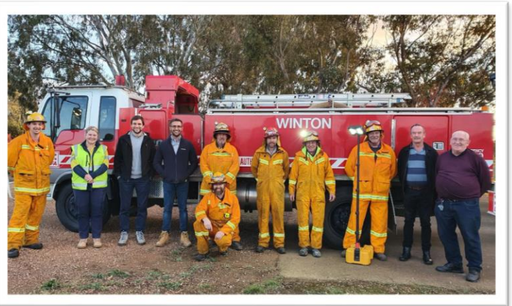
Winton CFA members with new safety equipment (above) Winton Cemetery's new seating (below left) and a new water tank for Tatong Hall (below) just some of the community outcomes delivered via the 2020 Winton Solar Farm Community Grant.