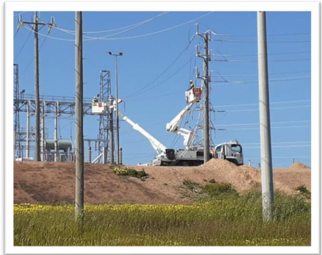
Overhead line works at the existing Glenrowan substation.