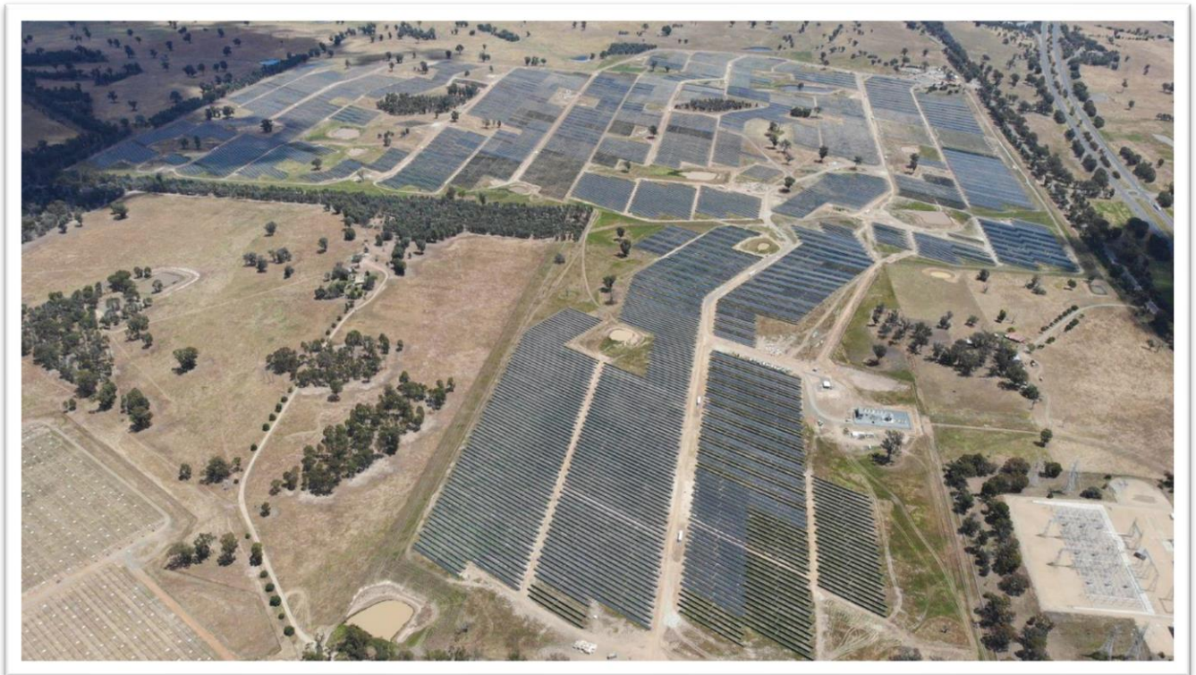
Aerial photo of current construction works