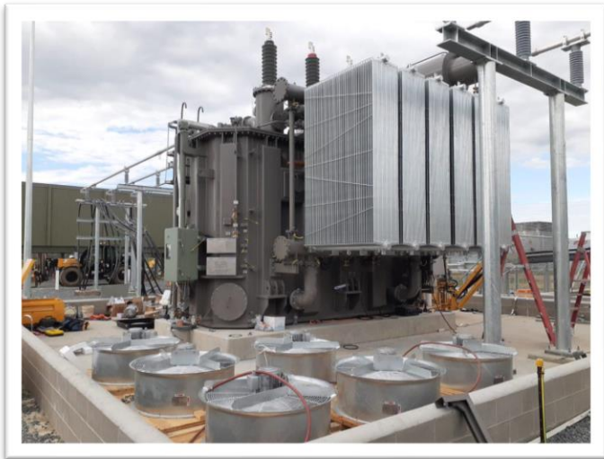
The solar farm's transformer – now installed.