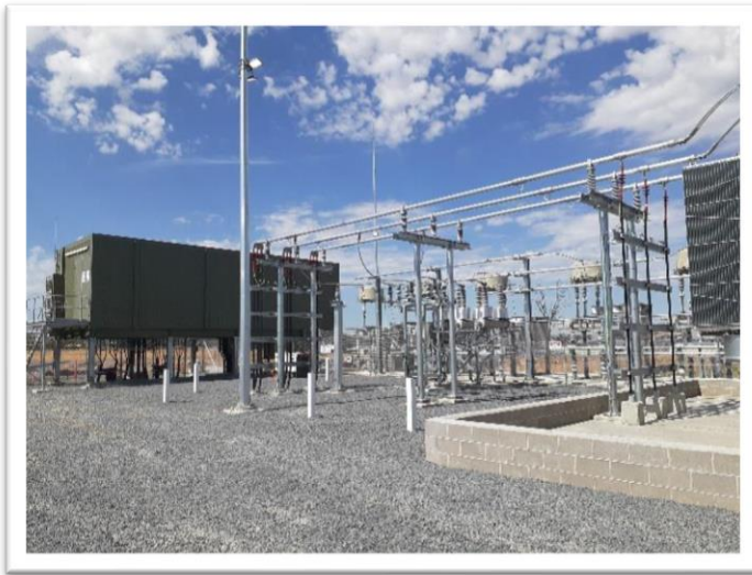
Solar farm substation and control room.