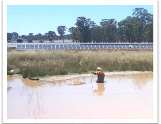
Planting of stabilising native grasses around the perimeter of preserved dams.