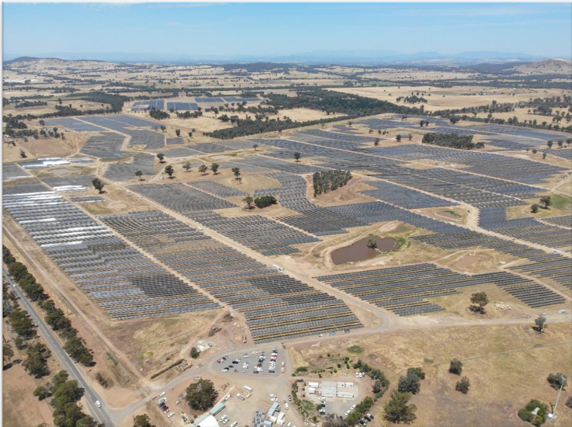
Aerial photo – the Winton Solar Farm is almost complete!